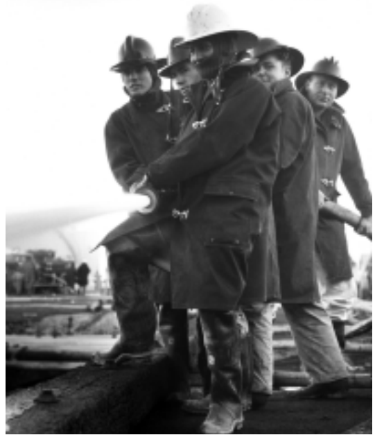
Amoco Virginia ship fire - Hess Terminal - Nov. 1959