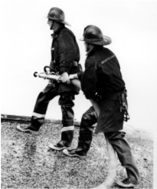
Fire Fighters 1960's