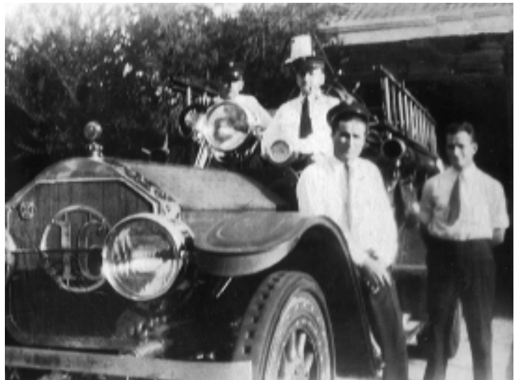
Fire Station 16 1413 Westeimer Avenue - Early 1930's