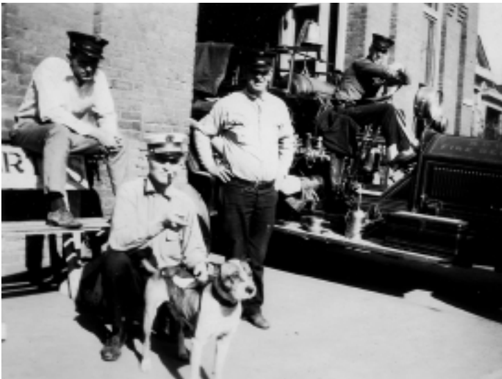
Fire Station 6 1702 Washington - Early 1930's